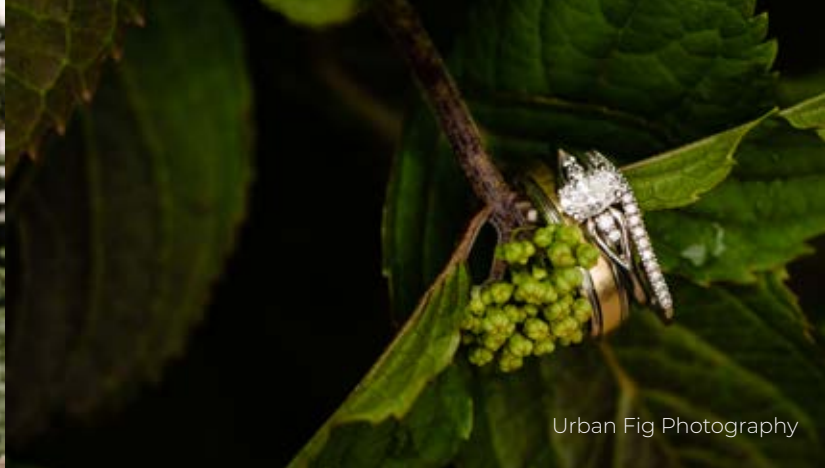
Urban Fig Photography