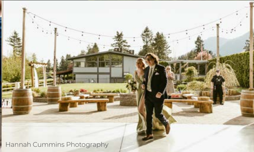
Hannah Cummins Photography