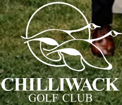
Kristara May Photography